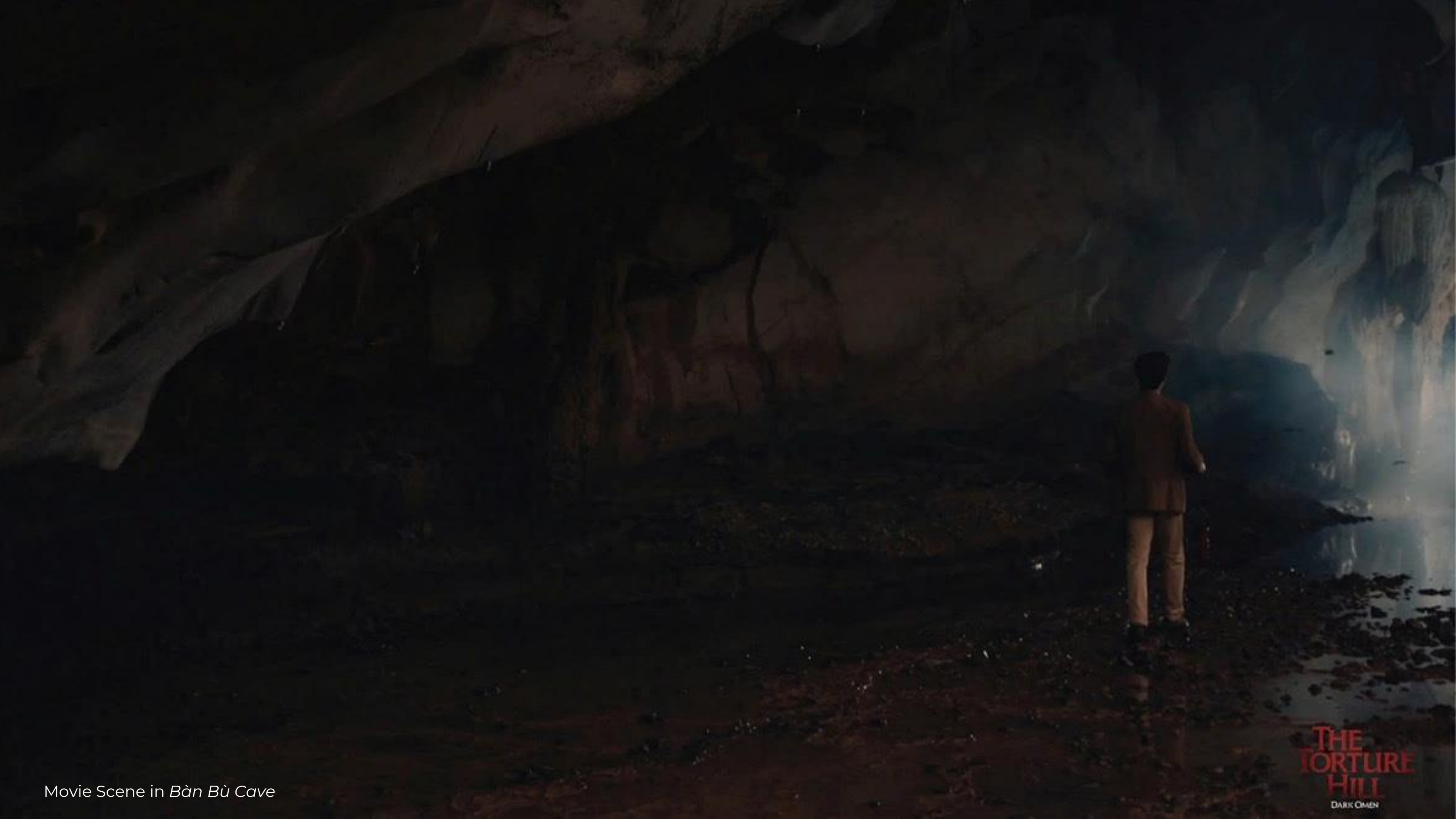
Movie Scene in Bàn Bù Cave