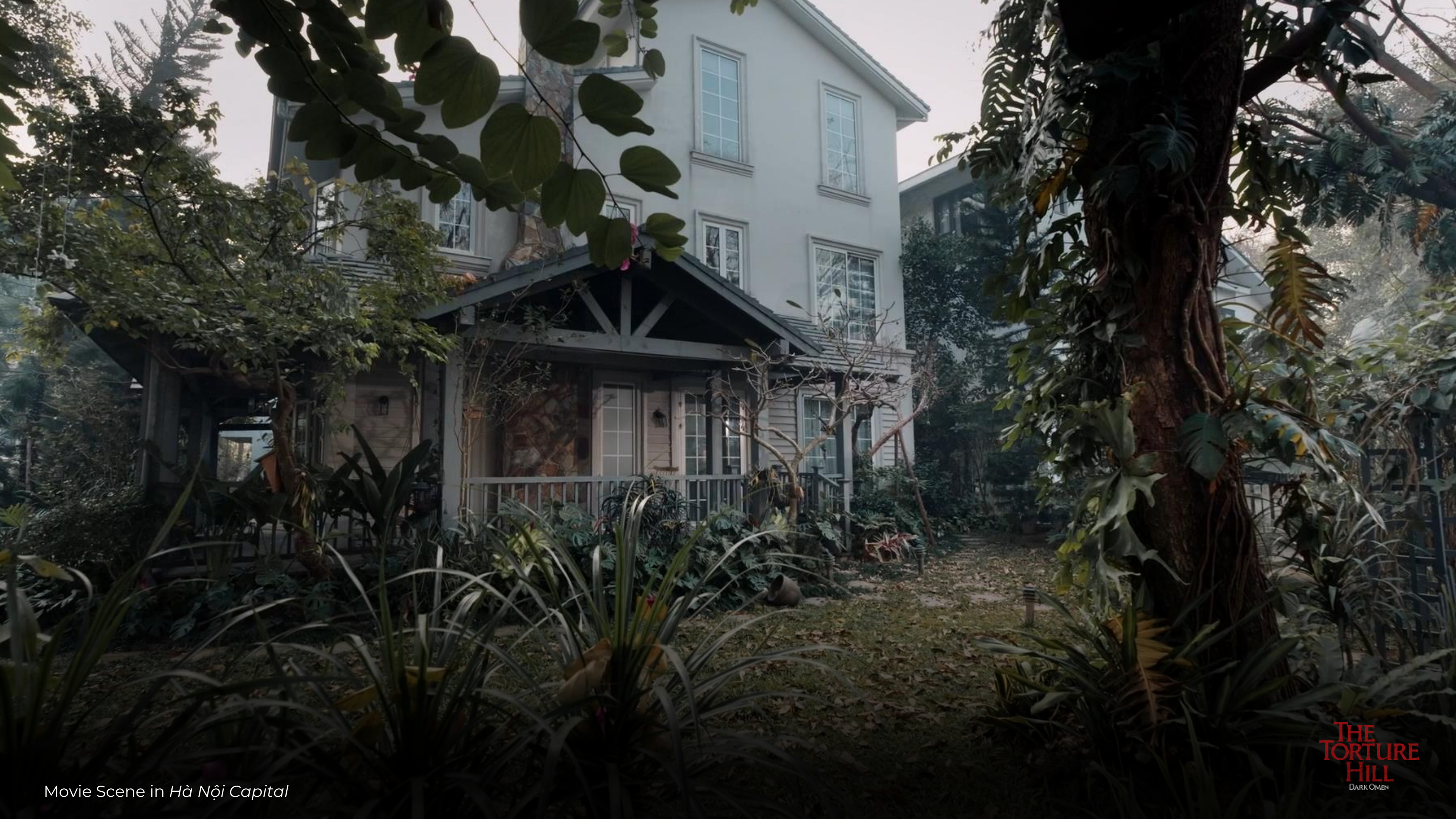
Movie Scene in Hà Nội Capital